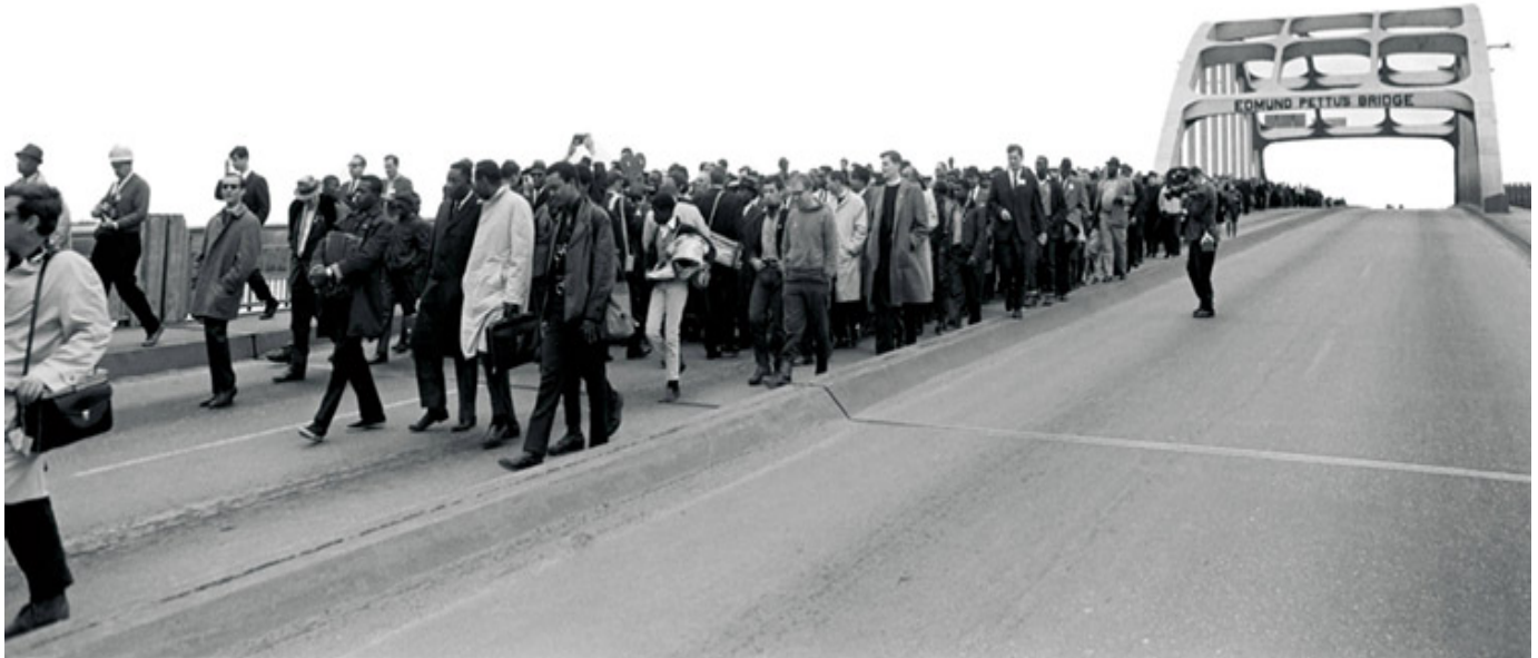
Marchers at the Edmund Pettus Bridge in Selma, Alabama.