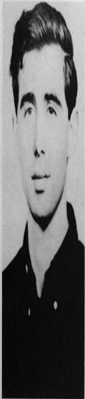
MICHAEL HENRY SCHWERNER