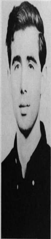
MICHAEL HENRY SCHWERNER